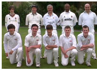
The victorious 3 rd XI