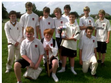
Chafford's winning team